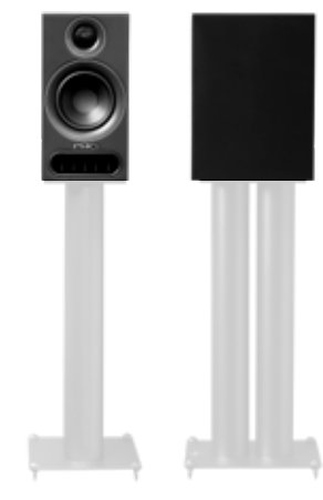
Stands not included