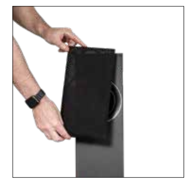
The optional grilles are magnetically attached to the cabinet to eliminate unsightly fastenings.