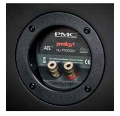
Binding posts accept spade lugs, 4mm 'banana' plugs and bare wire for a connection of the highest integrity.