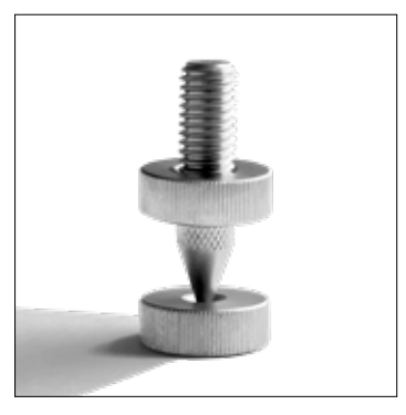
Pucks are included with the prodigy5 to protect sensitive or hard floors from the performance enhancing spikes.